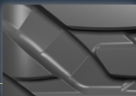
Inter-lug terraces Good self-cleaning.