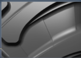
Inter-lug terraces Good self-cleaning.