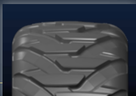
Wide flat tire profile Excellent compatibility with tracks.