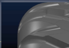
Wide lug shoulder Good track lateral stability and shoulder robustness.