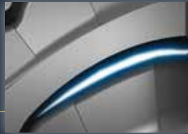
ProgressiveTraction® technology Improved traction performance.