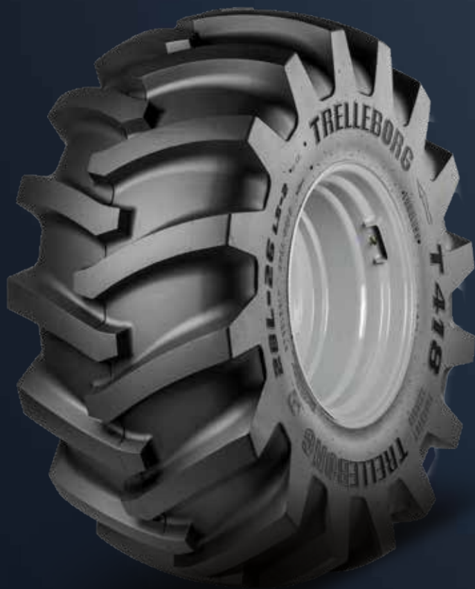
Forestry Skidder T418