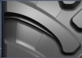
Lug angle and design Extra pull force and accessibility.