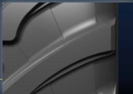
Wide lug shoulder Good track lateral stability and shoulder robustness.