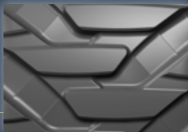
Transverse grooves Optimal grip in tracks.